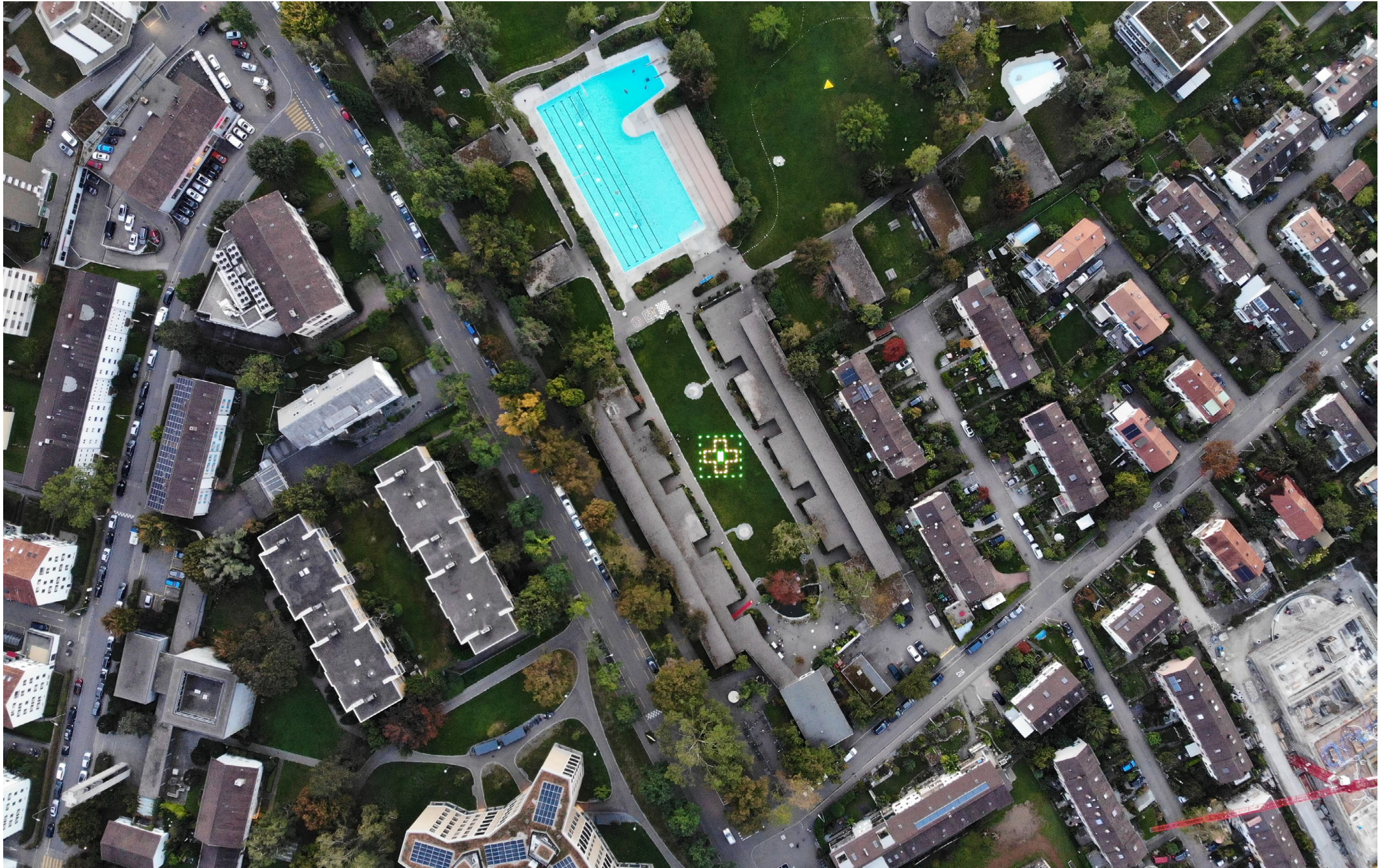
Drone photo of Plan H LED light installation at the Max-Frisch bad in the workers' district of Albisrieden, Zurich. Green and white Unex LED lights, 11 M 2